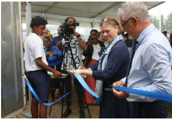
Commissioning of the Echinoderm Containerized Hatchery