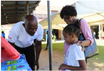
World Fisheries Day Exhibition