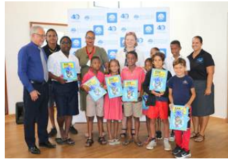
Launching of 'Zak' Aquaculture comic book