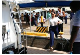
Commissioning of Surveillance 2 vessel