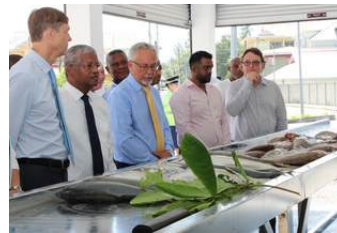
Opening of Anse Aux Pins Fishing Facilities