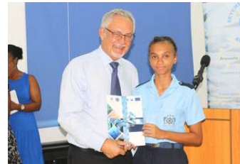
Labour Day Picnic