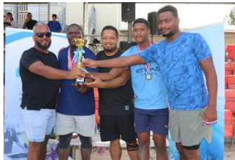
Sports Day for 40th Anniversary