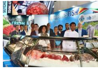
Seafood EXPO in Barcelona