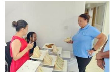
First Social Committee activity