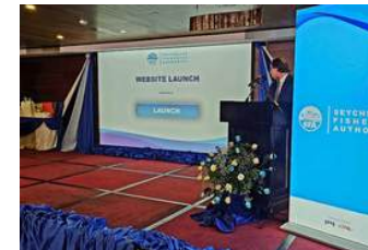
Launching of SFA website for 40th Anniversary