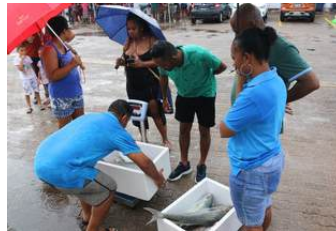
Launching of Seychelles National Aquaculture Policy