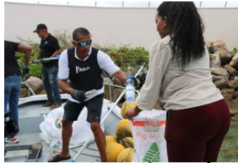
Ocean Clean up for Oceans Festival