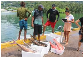
Fishing Competition for 40th Anniversary