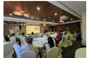
Aquaculture Investment Forum