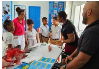
Fisheries Festival on Praslin for 40th Anniversary