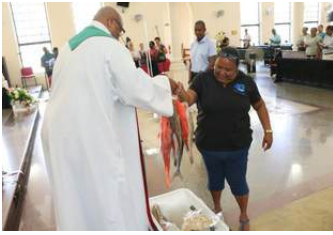
World Food Week