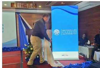
Launching of SFA logo for 40th Anniversary