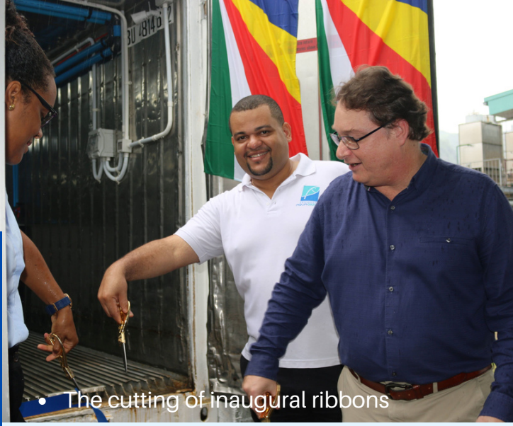
• The cutting of inaugural ribbons

The Aquaculture department records new achievement with a first containerized hatchery for sea urchins and sea cucumbers.