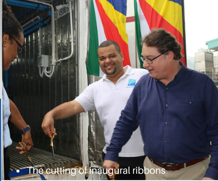
• The cutting of inaugural ribbons

The Aquaculture department records new achievement with a first containerized hatchery for sea urchins and sea cucumbers.