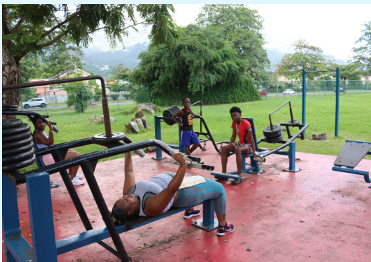
• The Tuesday fitness sessions at fitness trail.

The moral aim of the group is to continuously build on each progress made.