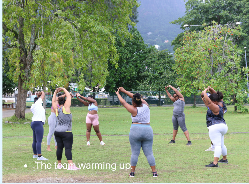
• The team warming up.

The SFA Fitness club resumes classes this February. The club has now reorganized into two sessions per week with two instructors.