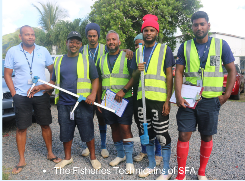
• The Fisheries Technicians of SFA